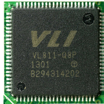
Q8P: QFN88 Package