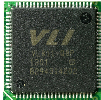
Q8P: QFN88 Package